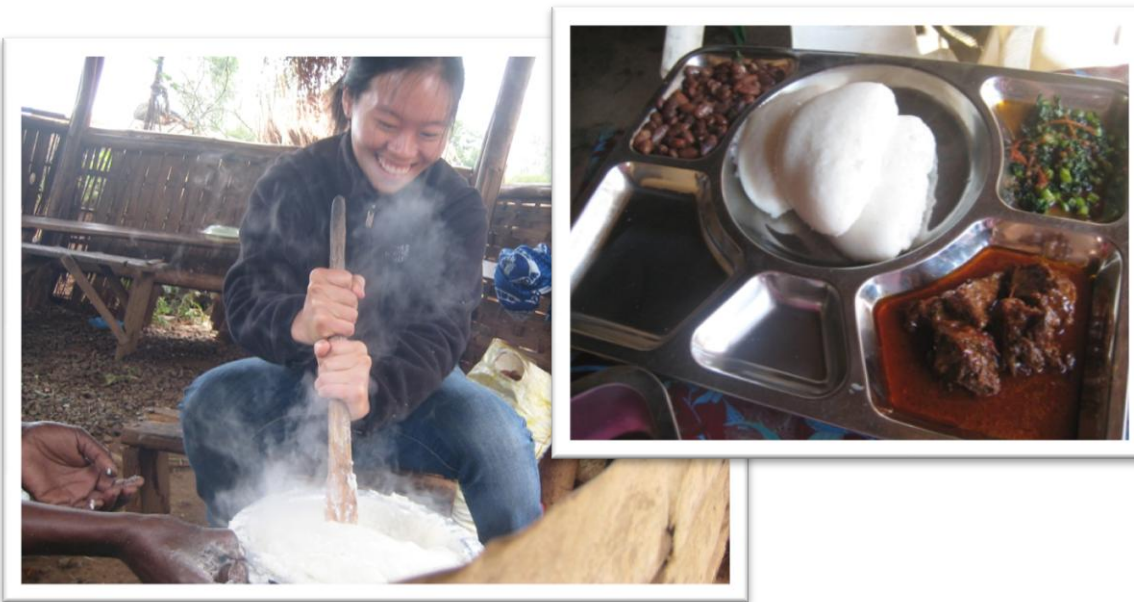
Learning how to make nsima, Malawi's staple food, from my Malawian grandma

Working in the field and on the policy level was intense and incredible. Every person I met had his or her own story to tell. As I immersed myself in each community, I gained a deepened understanding of independence, priorities, and the dynamics of relationships.