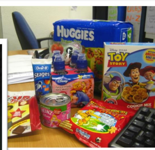
Surveys of marketing tactics used by EU Pledge companies, including Walt Disney