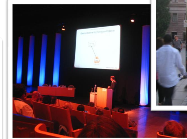
International Congress on Obesity 2010 in Stockholm, Sweden with top experts in the field of public health

From the start, I recognized at times efforts must be seen with a long-term perspective. By the end, I left with even greater intentions than going in, gaining a greater appreciation for impact on the global, community, local, and individual level.